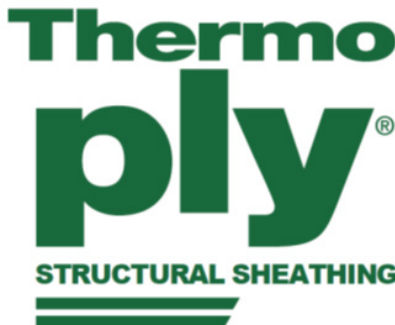
Figure 1. Thermo-Ply Green Structural Sheathing