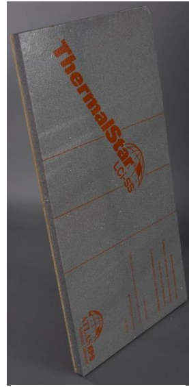
Figure 2: LCI-SS R7.5