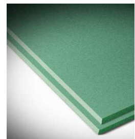
GreenGuard® XPS SL