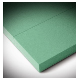
GreenGuard® XPS SB