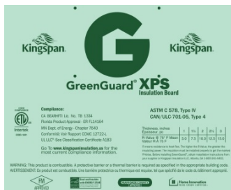
GreenGuard® XPS Label